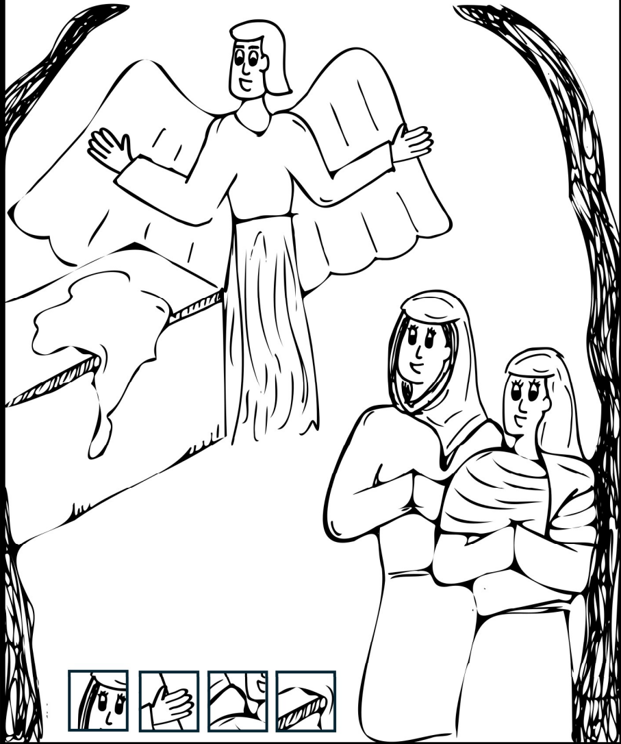
Year A: Solemnity of Easter Sunday of the Resurrection of the Lord

When the women visited Jesus' tomb, an angel appeared and told them that Jesus had risen!